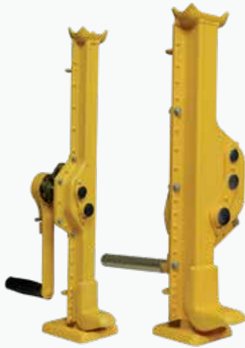
CJ15 & CJ100 Shown