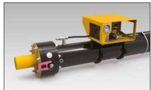
▲ Hydraulic control situated at the working end of the cylinder for ease of use.

The durability, ease-of-use, anti rotation feature and fail-safe locking mechanism make the Enerpac LSA a safer choice for maintenance crews repairing in-service pipelines that are under pressure.