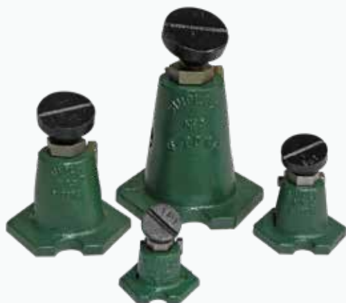
PJ1P, PJ2P, PJ3P & PJ4P Shown

Sustaining Capacity .....► 2 - 8 tons Weight .....► 1.5 - 12 lbs. Operable Rise .....► 1 - 4 in.