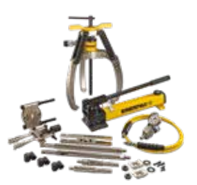
Hydraulic Lock-Grip Master Puller Sets, LGHMS-Series