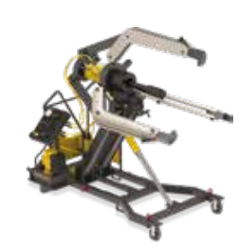
100 ton Hydraulic Lock-Grip Pullers, LGH-Series