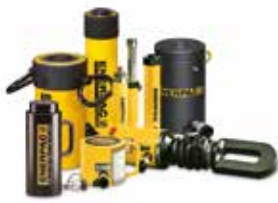
Cylinders & Lifting Products