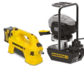
Cordless Hydraulic Pumps